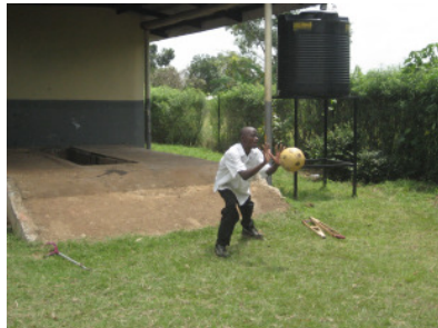
...sports in the afternoon...