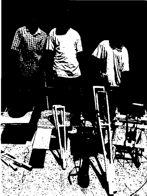
Appliances made by the workshop staff

The construction of the external workshop has started.