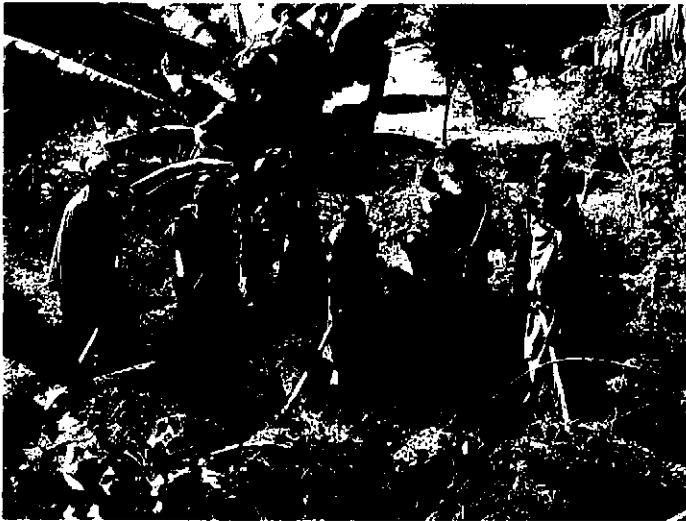
Attendants and older PWD's are active involved in gardening.